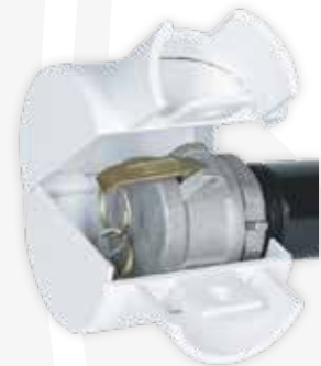
Boot fits snugly around pipe caps