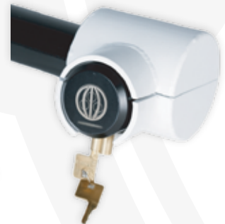
Boot locks securely