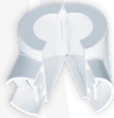
Pipe boot comes in black and white

Grease theft is a common problem for restaurants and businesses that store or pipe their used cooking oil outside. For those businesses that have pipes extending outside from an indoor used oil container, Baker Commodities has developed a new anti-theft device that protects the valuable used cooking oil.